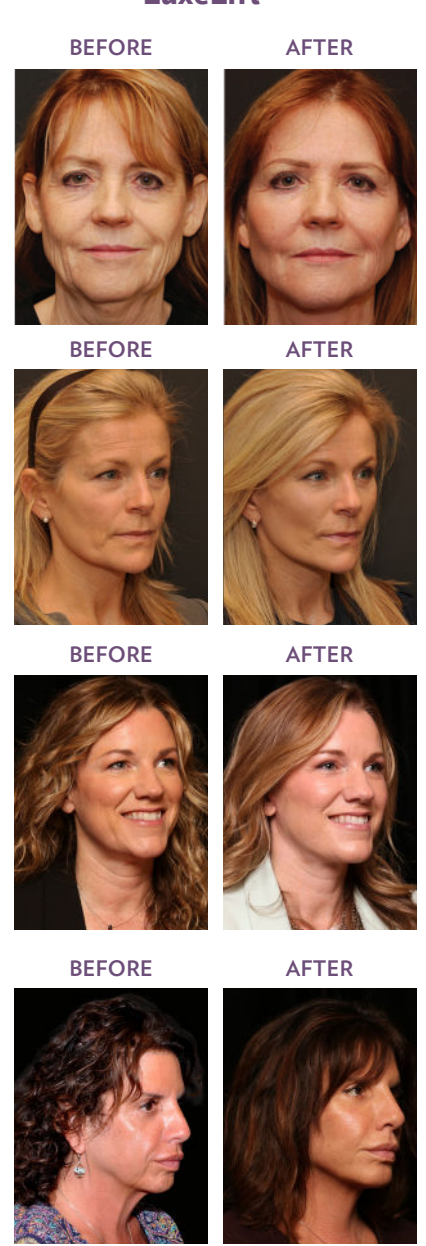
Facelift with VolumeLift<sup>SM</sup> for a world class result.

To see more of the amazing procedures we offer, visit our website at drdonath.com